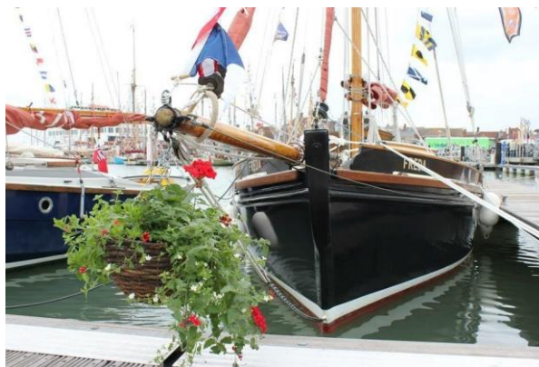
Freda at Yarmouth, Isle of Wight