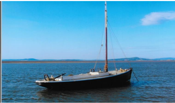
Linda off Morecambe now

1984 Venture built as a fishing boat from mould, for use off the Wirral coast