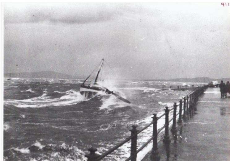
Sir William Priestley in action off Morecambe

1987 Enters collection of Lancaster Maritime Museum. The Museum first opened in 1985.