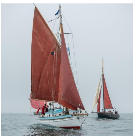
Minx at Brixham Regatta 2018