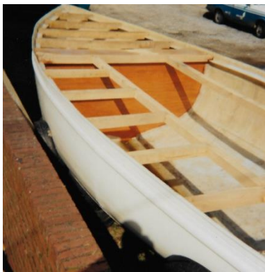
Linda being fitted out