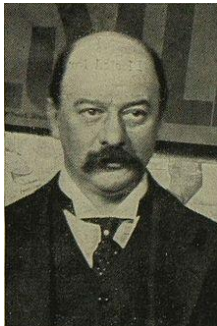
Sir William Priestley